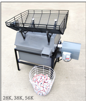
28K, 38K, 56K