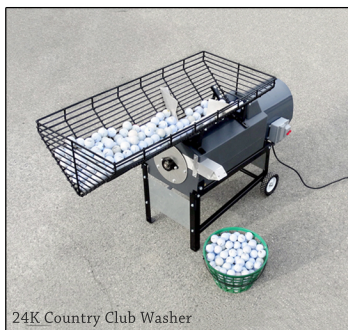
24K Country Club Washer